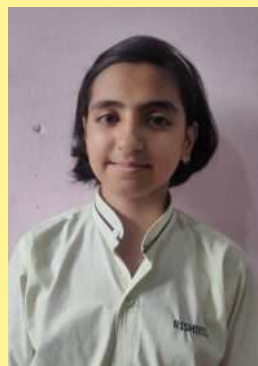
Tarushi VII E Quiz Got First Position